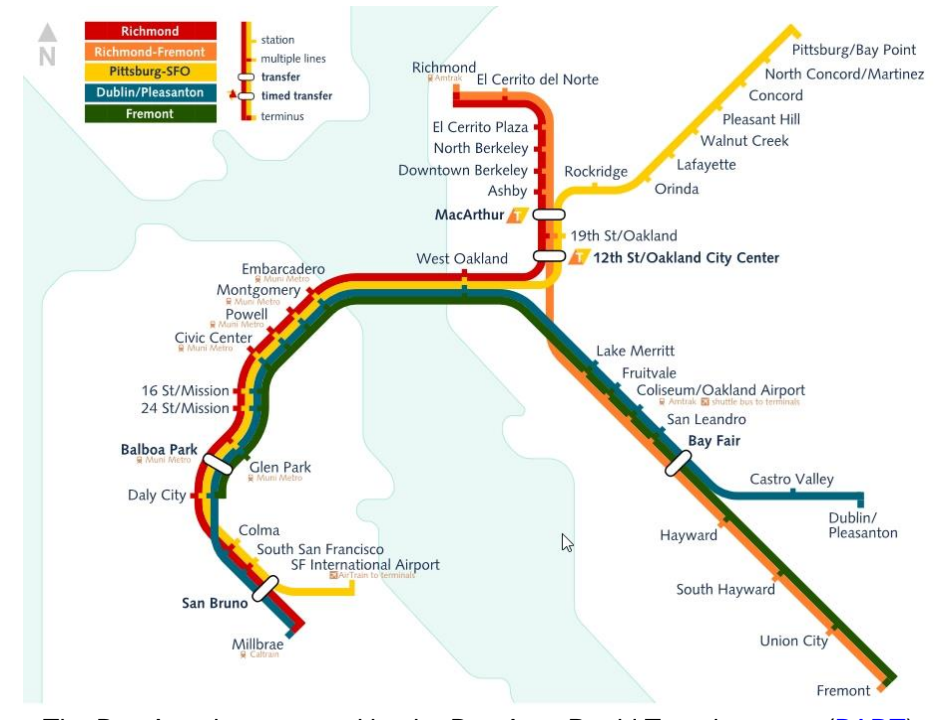
The Bay Area is connected by the Bay Area Rapid Transit system (BART)